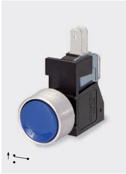
383 2510 K BL