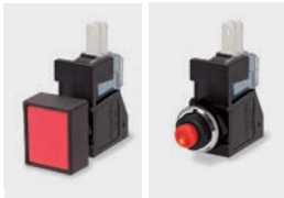
383 2510 RR 383 2510 PR